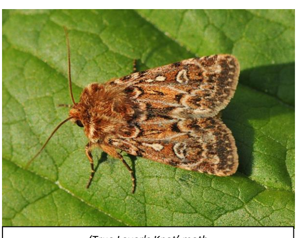
'True Lover's Knot' moth

At the close of the Mid-Summer evening event the moths were duly released. An Obscure Wainscot was trapped, it is normally found in reed bed habitat. Its main food plant is the Common Reed.